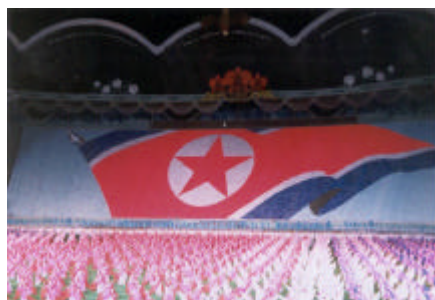
North Korea's famed mass gymnastics displays embody the single-hearted unity of the Korean people.