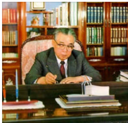
The late President Kim Il Sung was a faithful servant of the people

A famous painting depicts Kim Il Sung sitting and reading on a hill, gazing out towards the sea. On his lap is a book.