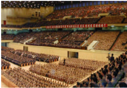
Thousands gather to commemorate late President Kim Il Sung at Pyongyang's Indoor Stadium.