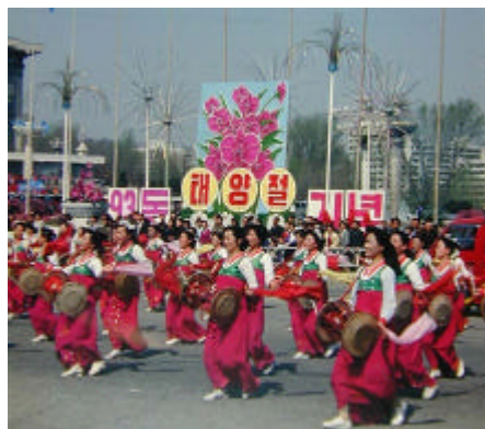
Pyongyangites celebrate the Day of the Sun

In the early period of his revolutionary activities he taught truth that the army of the revolution provides a sure guarantee for realizing the national desire of the Korean people. He set out the idea and line on attaching importance to arms and, on its basis, created armed ranks and waged the anti-Japanese armed struggle, thus achieving the historic cause of the liberation of the country and establishing the brilliant revolutionary traditions of the WPK.