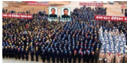
Workers at the Taeon Friendship Glass Factory attend a rally.

PYONGYANG, March 16 (KCNA) -- The Taeon Friendship Glass Factory which is under construction amid the deep concern of the peoples and builders of the DPRK and China has begun to show its imposing appearance. Builders and technicians of the two countries have dynamically pushed forward the construction of the factory in a little more than eight months since the successful blasting involving one million cubic meters of earth.