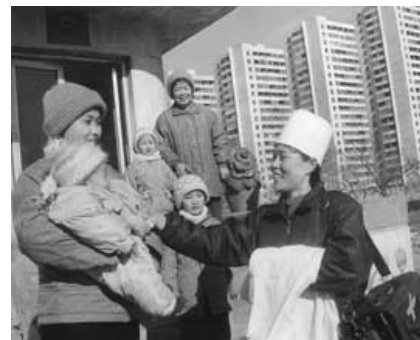
DPRK medical workers perform house-calls.

PYONGYANG, April 8 (KCNA) -- A meeting for discussing issues related to the health of mothers and children was held at the People's Palace of Culture in Pyongyang on April 7, the World Health Day. The meeting fully showed that the mothers and children have enjoyed a