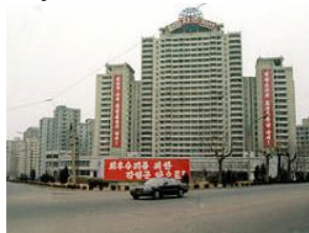
Pyongyang decorated in celebration of the Day of the Sun

He set out the idea and theory on global independence, encouraged the world progressive people to turn out in the struggle to build a new independent world by their concerted efforts against the domination and subjugation of the imperialists, thus opening a bright prospect of the revolutionary people struggling for independence.